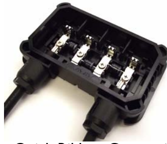
Quick Ribbon Connection (Clamping Type)