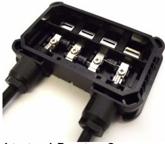
Limited Potting Space (Soldering Type)