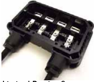
Limited Potting Space (Soldering Type)