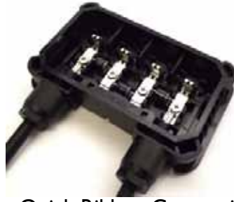
Quick Ribbon Connection (Clamping Type)